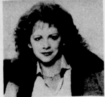
Reba McEntire—Vocalist of the Year

Quit Now! is designed for the smoker who is ready to quit immediately. During the session, the instructor will outline the program and explain techniques