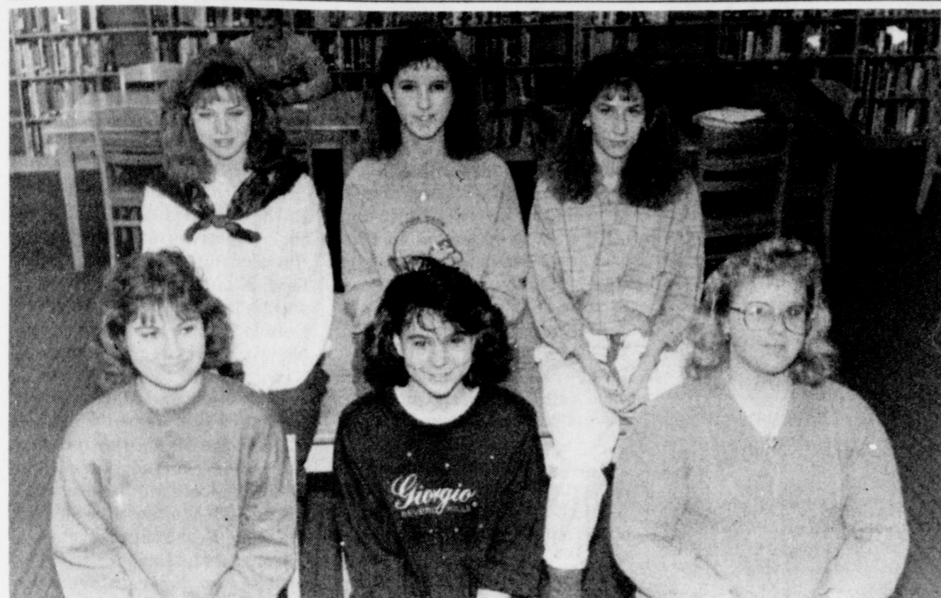
Sno Queen Candidates