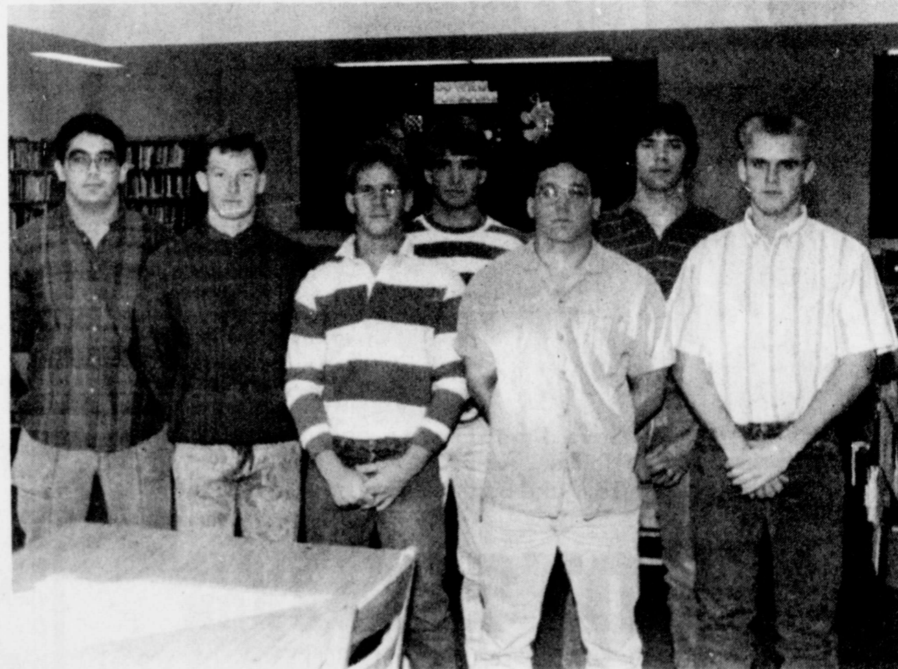
All-District Blizzards named

Seven members of the 1988 Winters Blizzards were named to the District 6-AA All-District Football Team recently.