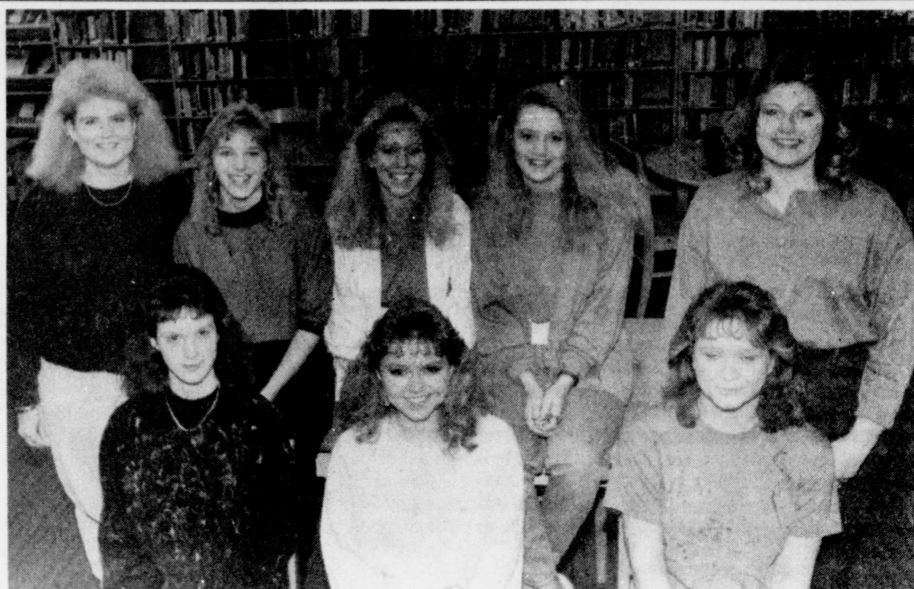
Sno Queen Candidates