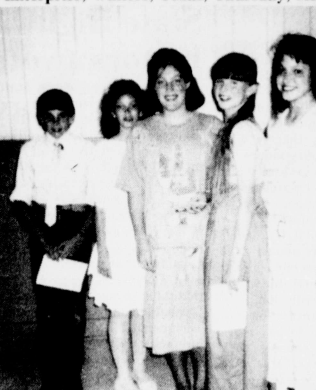
7th Grade Outstanding Bandsmen

Handmade furniture and original art make the Gun & Knife Show a 'must' trip for redocorating.