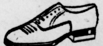
GROWING GIRLS' SCHOOL OXFORDS

All tan calf, 8-8 block heel, rubber cap. Made for entire comfort for the growing foot. Very smart and very serviceable.