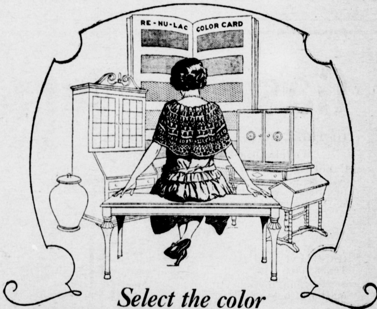
Select the color

SALINGER STATE BANK TEXAS STRICTLY A BANKING INSTITUTION