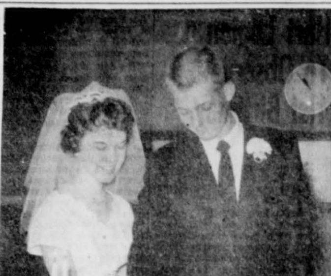
Dimmitt Garden Club Meets Tuesday at 3 p.m. The Dimmitt Garden Club met at the Community Room in the First State Bank Tuesday, February 9, at 3 p.m.

STEP OUT IN IT: Get the most proof of Chevrolet's superior performance on the road. No other car in the low-priced three-wheel drive Chevy has the same sensation you get from a ride in the 1960 Chevrolet.