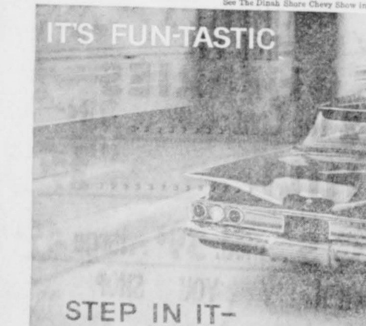
See The Disk Drive Chevy Show in color Sunday, NBC-TV—the Pat Boone Chevy Showroom weekly, ABC-TV.

STEP OUT IN IT: Get the most proof of Chevrolet's superior performance on the road. No other car in the low-priced three-wheel drive Chevy has the same sensation you get from a ride in the 1960 Chevrolet.