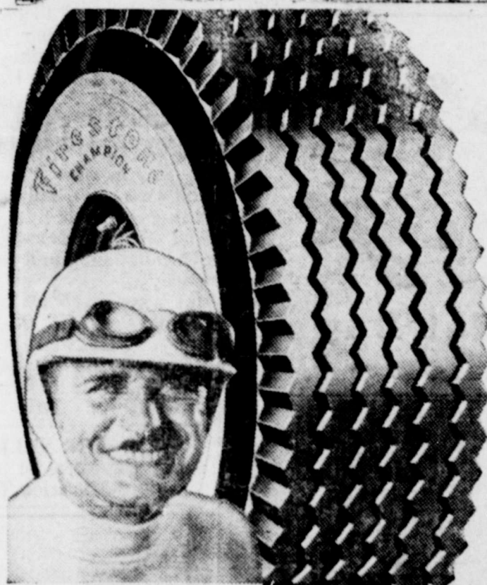
WILBUR SHAW, the 1939 winner

On May 30th, Wilbur Shaw drove to his second victory in the 500-mile Indianapolis Race on Firestone Champion Tires at an average speed of 115.03 miles an hour. Champion race drivers, whose very lives and chances of victory depend on tire safety, know tire construction. That is why they select and buy Firestone Tires for their racing cars.