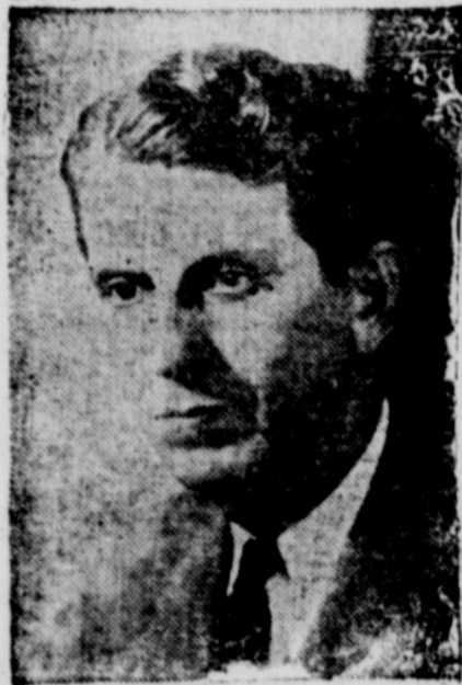
Congressman Charles L. South, who announces for re-election

gress eight years ago, South advocated (1) lower interest rates on homes, including farm and ranch homes; (2) an opportunity for deserving tenants to purchase homes on liberal terms; (3) soil conservation and parity prices for agricultural products; (4) truth-in-fabric legislation, which informs a purchaser of the fiber content of a garment by requiring the use of proper labels; (5) a better and more stable income for farmers, and wage earners in the lower income brackets.