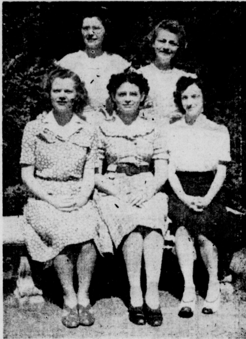
The above are the personnel of the Youth Caravan of the Methodist church who are to be with the Bronte Methodist church, embracing the period from August 1 to 8.

Your Trade—Your Good Will—and Influence—are Appreciated.