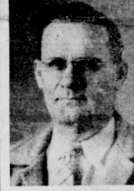
Coke County Agriculture Agent and Director 4-H Club Boys