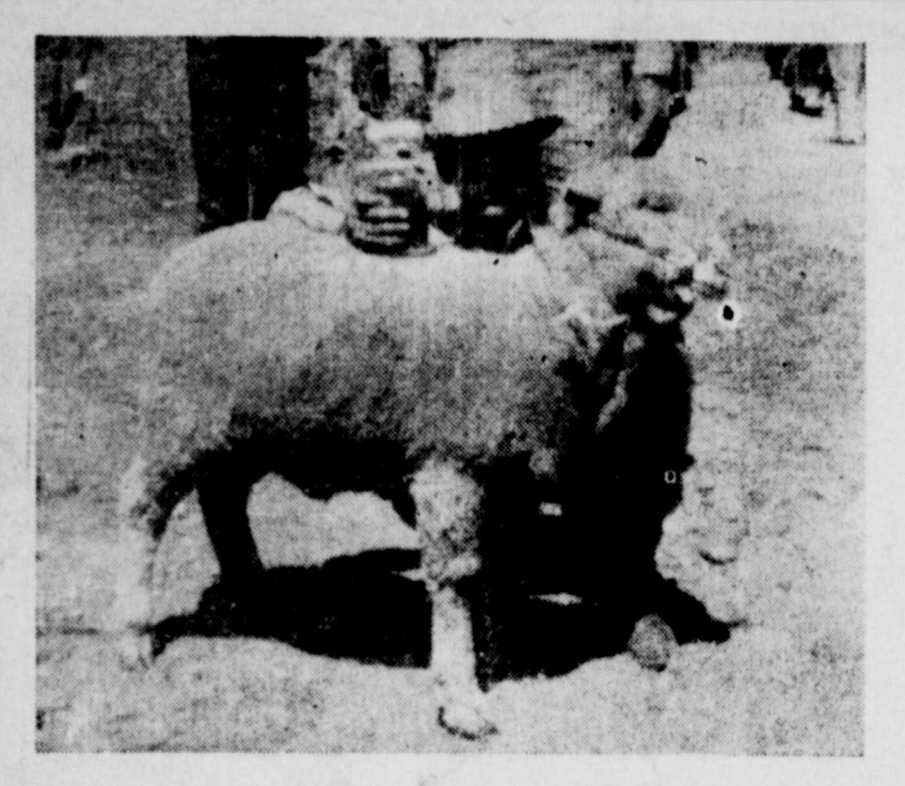
LAMB EXHIBITED LAST YEAR BY WELDON SCHOOLER. 4-H CLUB BOY

ATTENTION, FARMERS AND please leave your name with the RANCHERS