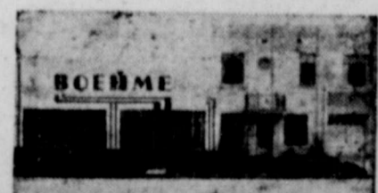
Our New Plant, Built in 1941

West Texas' Most Popular Loaf for Over 31 Years!