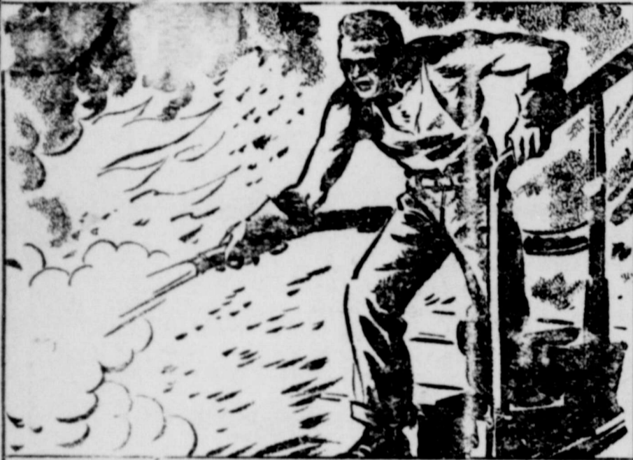
August 1, 1943, Chief Engineer, Beaumont, Texas, forced his way along the outside wall of his flaming, torpedoed tanker. He fought flames with steam. His actions saved the lives of crew members who would have perished otherwise, and he was awarded the Merchant Marine Distinguished Service Medal. Have you bought a War Bond this payday? U. S. Treasury Department