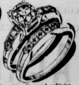
Stunning diamond solitaire with matched wedding ring. Both... $142 45