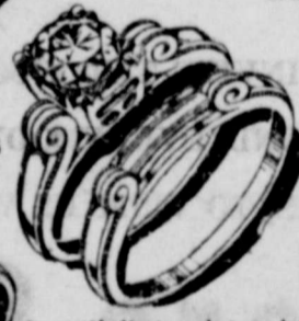
Beautifully sculptured diamond Bridal Ensemble. Both... $98 45