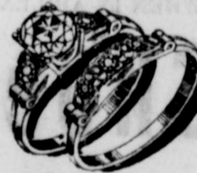
6-diamond Bridal Set. A creation of exquisite beauty. Both... $298 50