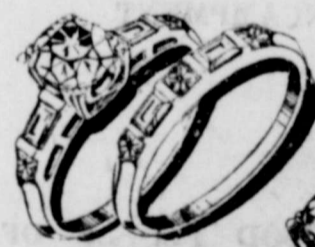
A triumph in styling is this diamond Bridal Duo. Both... $274 45

Symbolizing life's most important event, "her" diamond Bridal Set, chosen here, will be rich in happy memories. Its beauty as eternal as your love, it will be a source of deep pride and pleasure through all the years to come.