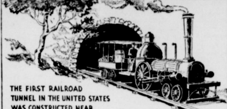
THE FIRST RAILROAD TUNNEL IN THE UNITED STATES WAS CONSTRUCTED NEAR JOHNSTOWN, PA. IN 1833.