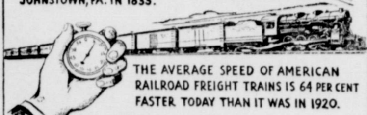
THE AVERAGE SPEED OF AMERICAN RAILROAD FREIGHT TRAINS IS 64 PER CENT FASTER TODAY THAN IT WAS IN 1920.