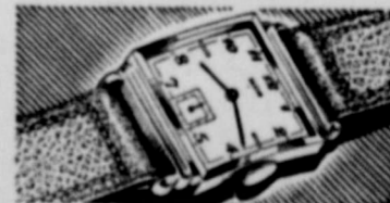
An example of the handsome new star-timed Elgin watches for men.