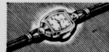
There is no finer gift than this beautiful new 19-jewel Lady Elgin.