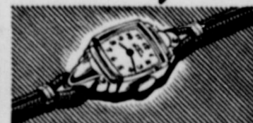
An Elgin De Luxe with smart simplicity of both case and bracelet.

War-time graduates may have had to wait for the traditional gift of an Elgin. But now they and the class of '46 can have the masterpiece of American watch-making... a beautiful, star-timed Elgin.