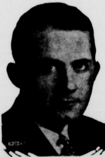
ALLAN SHIVERS of Jefferson County

Senator Allan Shivers is basing his appeal for promotion to Lieutenant Governor on service to his state and his country. Dean of the Texas Senate, he is rated one of the ablest and most active members of the legislature and, on his record alone, is entitled to be promoted to the rank of presiding officer of the Senate. He spent two years overseas as a soldier in World War II. (Political Advertisement)