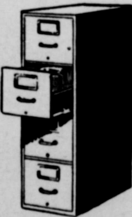
Safe-Files combine the convenience of a file with certified protection for vital business records.

Remington Rand AUTHORIZED SALES AND SERVICE AGENCY