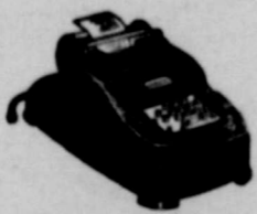
2 speedy figuring machines in 1... this calculator prints the profit!