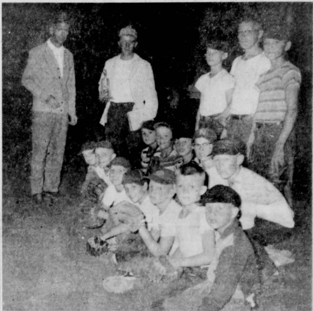
THE WINNERS — These Nazareth boys set a torrid pace Tuesday night to defeat the Dimmitt All-Stars 11-2 in the final game of the Dimmitt Invitational Little League Tournament. These boys were awarded the first place Little League trophy.

Further information about the sale can be had by contacting the ASC office in Dimmitt.