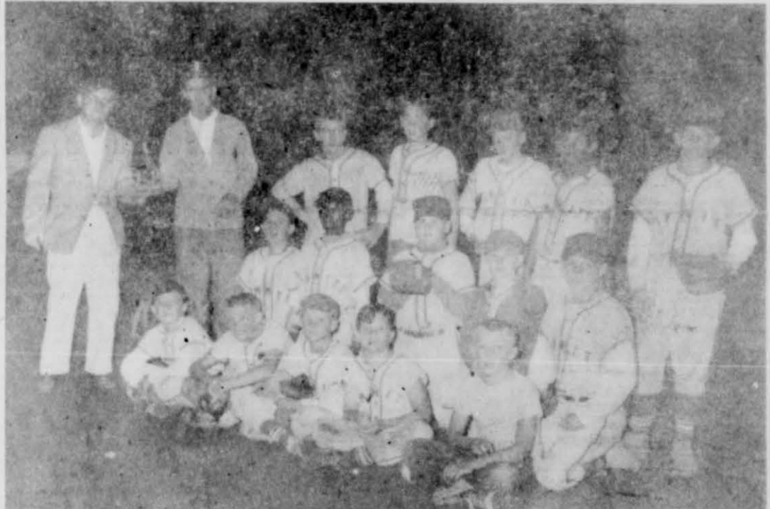
RUNNERS-UP — Taking second place in the Dimmitt Invitational Little League Tournament were these Dimmitt All-Stars. They were defeated by Nazareth in the final game.