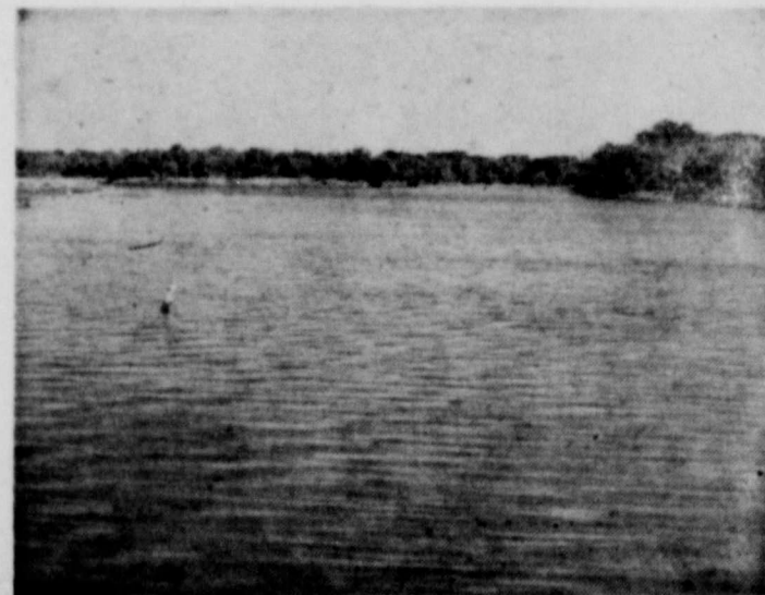
MILE AND A HALF OF WATER —At Boys' Co-Op Ranch near Tankersly, the camera looks out over a broad expanse of water that extends for a mile and a half back of a dam, offering facilities for boating, fishing, and water sports. Neglected or dependent boys from 32 counties of West Texas will be admitted to live on the Ranch upon recommendation of juvenile authorities.