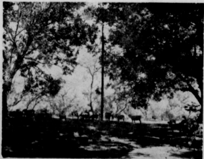
STOCK AT BOYS' RANCH —Sheep look quizzically at the camera from under the large pecan trees at Boys' Co-Op Ranch near Tankersly. The Ranch will be operated by and for parentless, neglected, or dependent boys from 32 West Texas counties from Fort Davis to Brownwood.