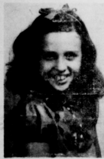
GRADE SCHOOL QUEEN-