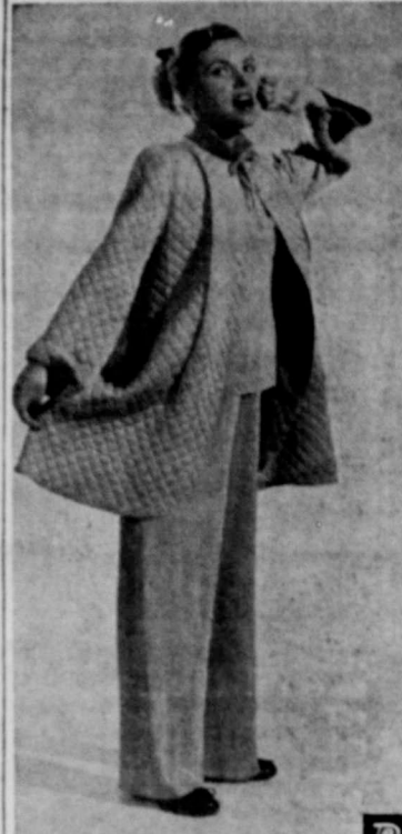
A Western adaption of a Chinese coat, quilted for good looks and warmth, makes the ideal study coat for the junior figure miss who wants comfort. Rich navy blue, lined with sharp lime, with slit pockets, a perky collar and neat piping trim gives it smart lines. Paired with matching two-piece pajamas it makes a gift supreme for the size 9 to 15 junior figure. It's styled by Carter's for good fit and long wear. $5.00; the gown, $4.00; and the pedal pushers are $9.95. Surely Confucius' daughters might have said: A well chosen gift gives happiness twice: to the donor and to the recipient.

The merry air of a Merry Christmas for the donor is pitched in a key of sound price. The coat is $12.95; the pajamas,