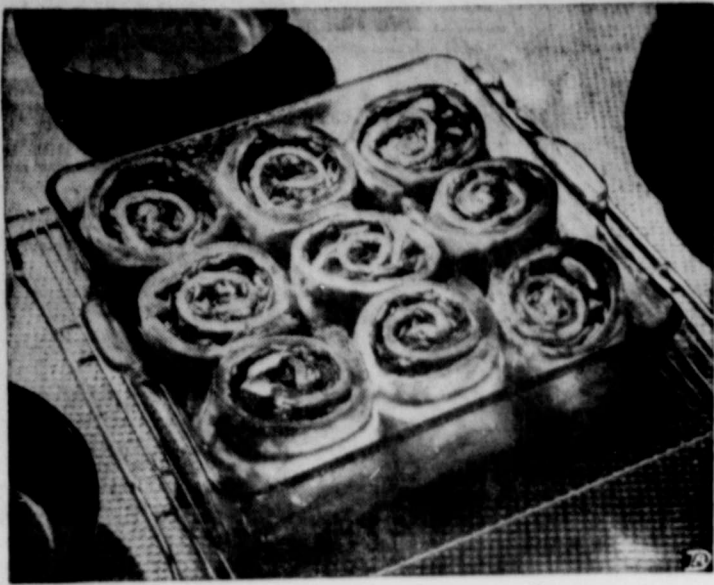
A new way with apple dumplings is to serve them warm with a cinnamon candy sauce.

It's apple time, and time to revive a popular dessert—apple dumplings. Those that mother used to make had whole apples baked in a pastry wrap. Here's a new treatment using flaky biscuit to create apple roll dumplings.