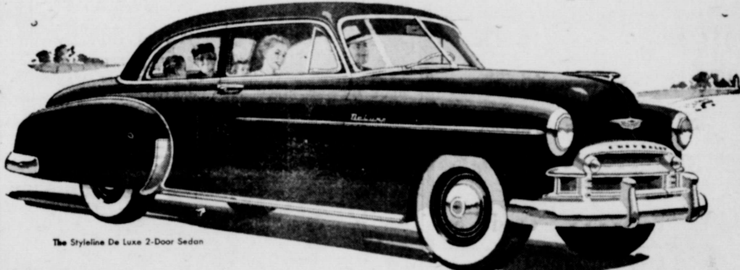
The Styleline De Luxe 2-Door Sedan