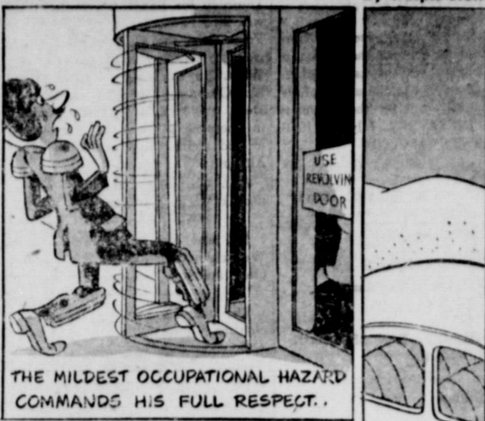
THE MILDTEST OCCUPATIONAL HAZARD COMMANDS HIS FULL RESPECT.