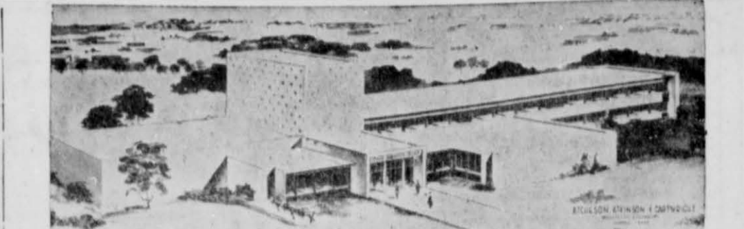
PROPOSED ADMINISTRATION BUILDING, LUBBOCK CHRISTIAN COLLEGE