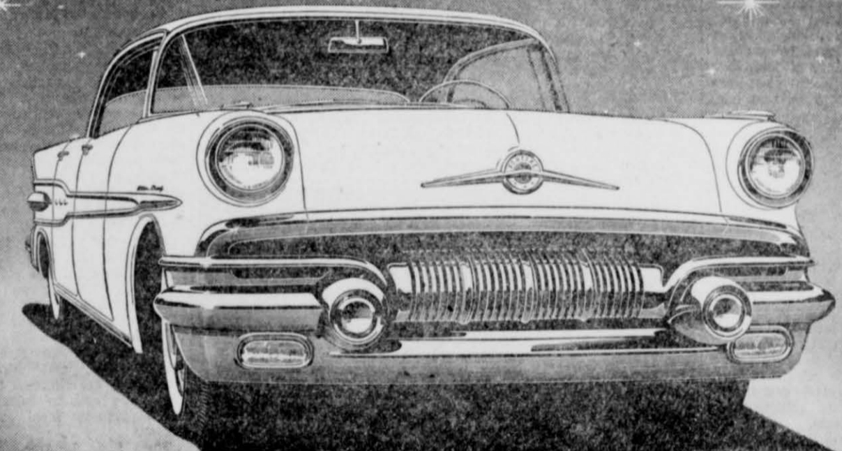
"DAYTONA GRAND NATIONAL CHAMP" A stock 317-h.p. Pontiac with Tri-Power Carburetion—extra-cost option on any model—best all competing cars regardless of size, power or price in the biggest stock car competition of the year!