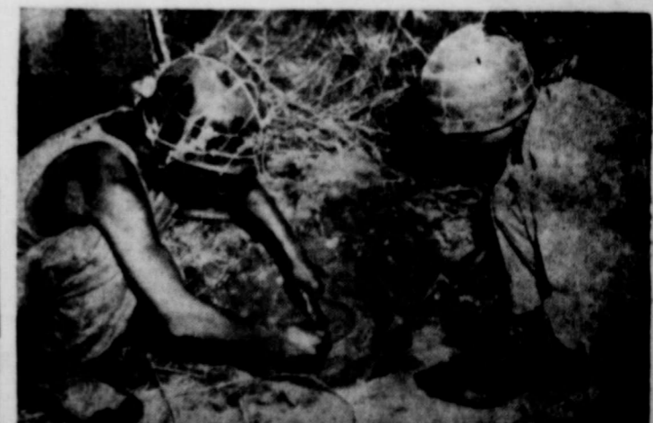
TANK WILL BE BLASTED

All members of the class and their families are invited and urged to attend the gathering.