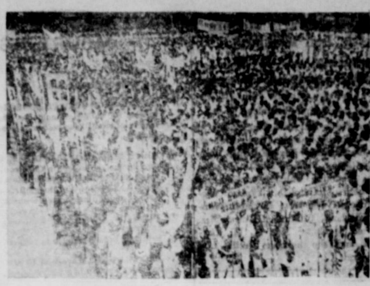
KOREANS CELEBRATE INDEPENDENCE PUSAN, KOREA — Koreans are shown gathered in Pusan's public square to celebrate their independence day. The banner appearing in lower right part of the photo reads "Let's welcome UN forces."