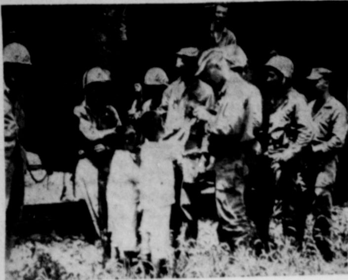
MARINES TREAT KOREANS