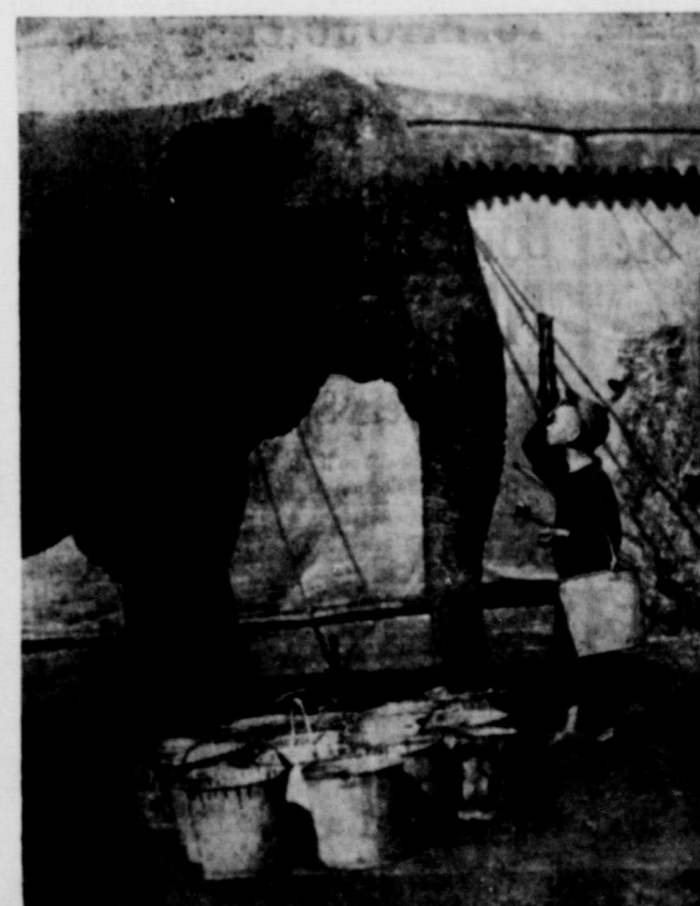
CIRCUS DAY SCENE-