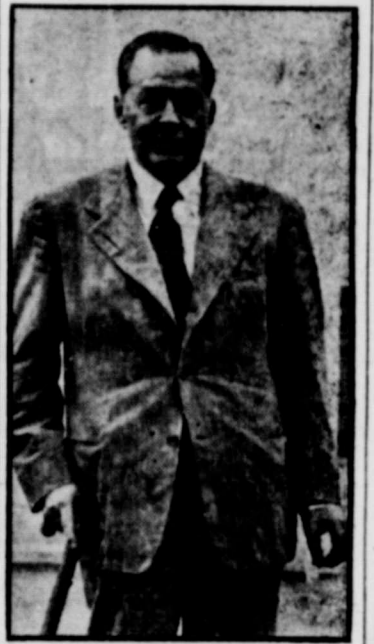
OUT OF THE ROUGH —Bobby Jones, recuperating from a back injury, strolls over the lawn of his home in Atlanta, Ga. Known to millions as Mr. Golf, Jones headlined the tee pasture during the 1920's but has been suffering with a bad back for many years.