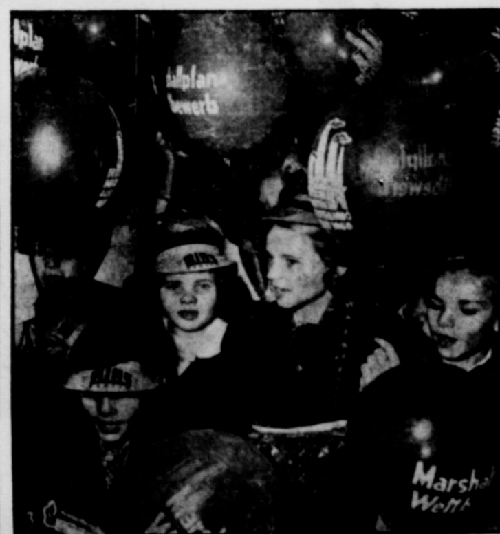
BALLOONS OVER BERLIN—Youthful visitors to the Berlin Industrial Exhibition get set to release their gas-filled balloons, which will carry greetings from them to people all over Europe as a part of a "Marshall Plan Balloon Contest." A postcard attached to the balloons instructs the finder to mail the card back to the German capital. The balloons found to have traveled the farthest will win valuable prizes for both finder and sender.