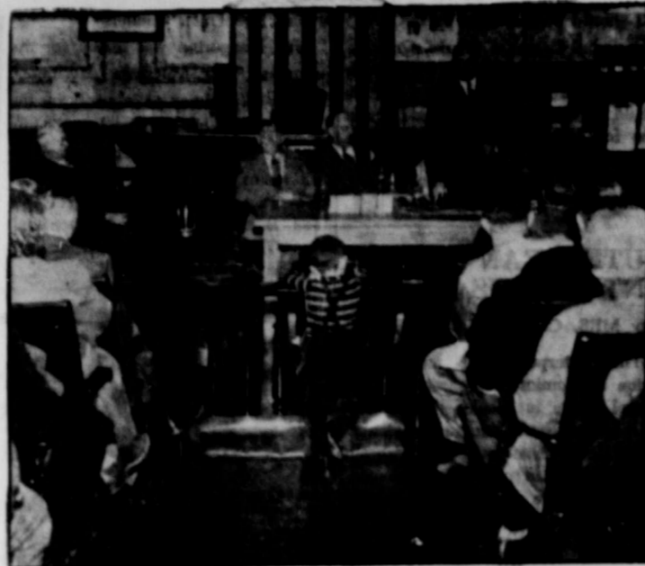
SPEECH STUMPS SMALL FRY —When Sen. Scott Lucas, campaigning for reelection on the democratic ticket, spoke at Watska, Ill., one listener in the courthouse audience apparently had trouble following the theme of the senator's speech. And so the corduroy-clad youngster sauntered down the aisle to stand at the rail where he could pay closer attention.