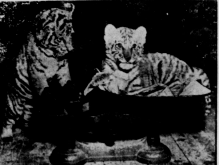
FIGHTER FAKES PAL'S POUNDAGE — There's no telling whether Battling Barney, right, really weighs 6½ pounds, as advertised, for his bewhiskered and striped sparring partner, Worcestershire Wally, seems to have a couple of thumbs on the scale. The cub fighters were born in a London zoo and Barney appears to have already gotten himself on the front page of a newspaper.