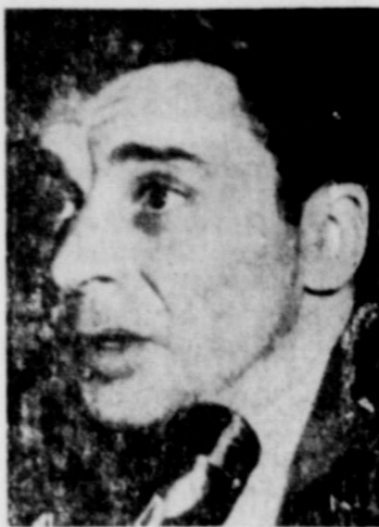
BIG BETS FOR BRODSON

National Advertising Representative AMERICAN PRESS ASSOCIATION