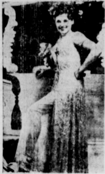
JUDY WINS OSCAR

NEW YORK—Judy Holliday, who recently rose to the fore among actresses, won the coveted Oscar award for the best female performer of 1950.