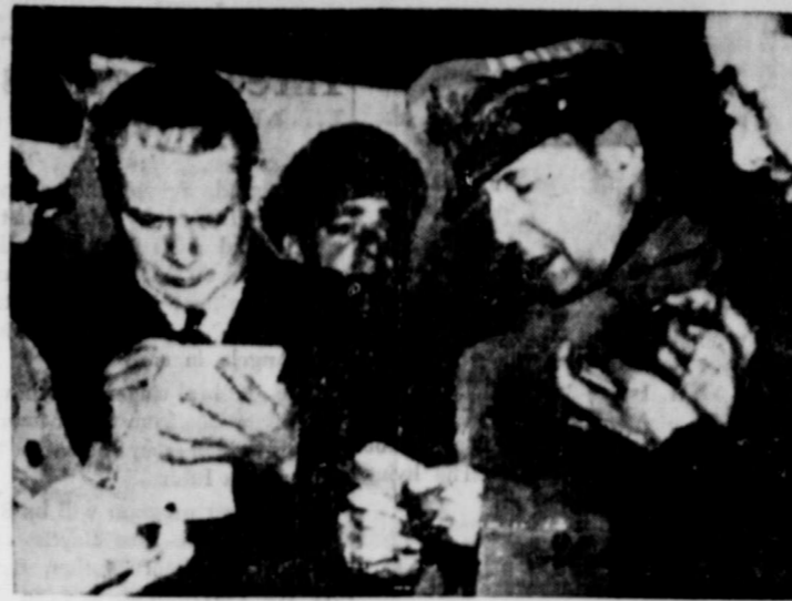
OFFERS TO MEET REDS

JAPAN—General Douglas MacArthur is pictured speaking to newsmen at Tokyo's Haneda Airfield after his return from the Korean