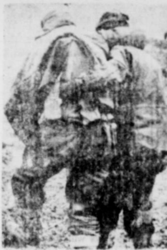
RIPPED UP THE BACK

HOENGSONG, KOREA — Man wounded (left) is given help to reach aid station by comrade, just outside Hoengsong, Korea. Coat and shirt are split up back, nearly torn off soldier by force of concussion when heavy explosive charge detonated nearby.