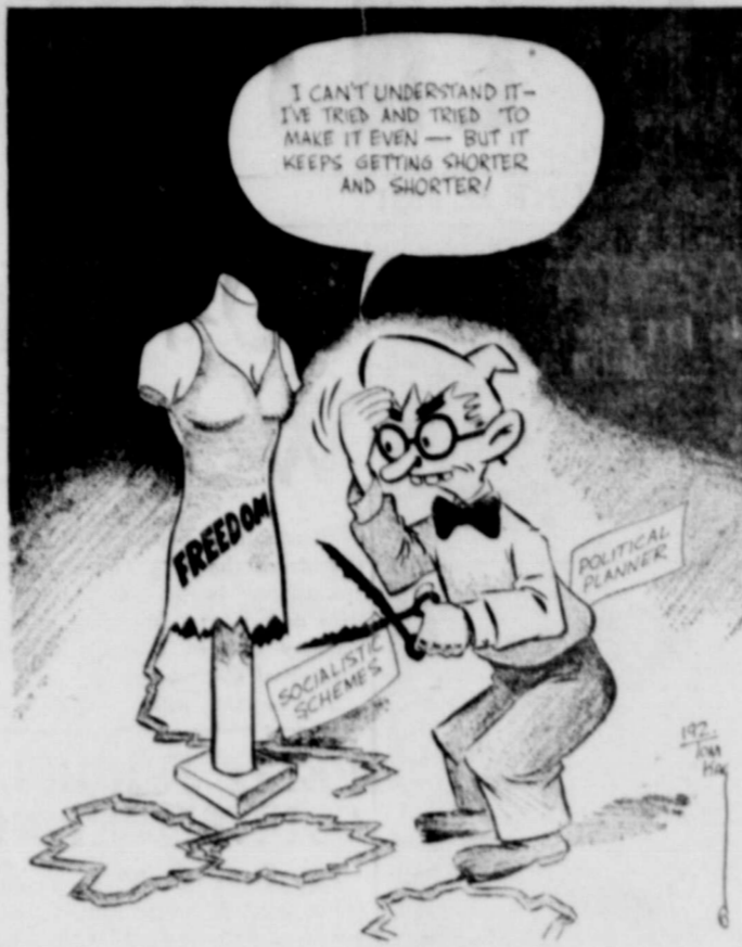
No Wonder, With Those Scissors!