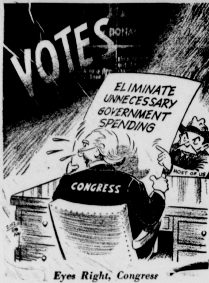
Eyes Right, Congress