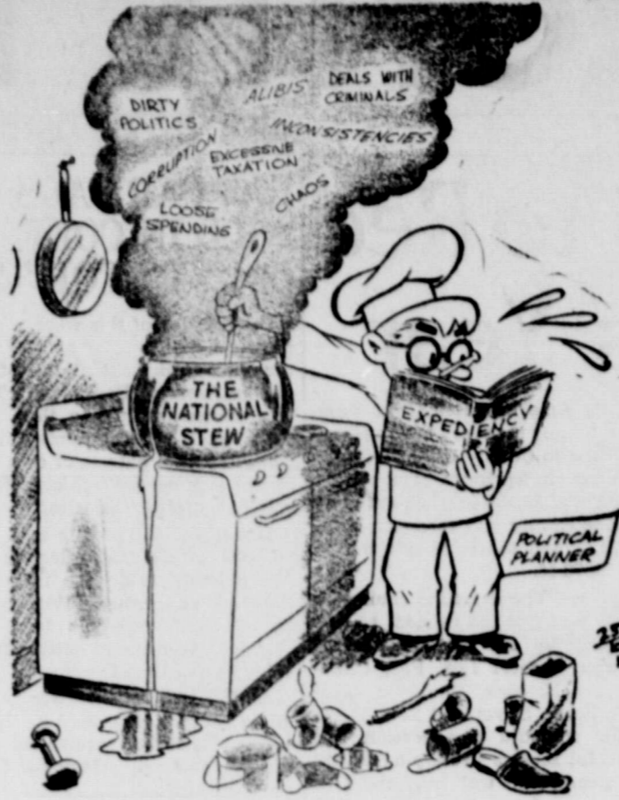
How To Spoil A Good Dish!