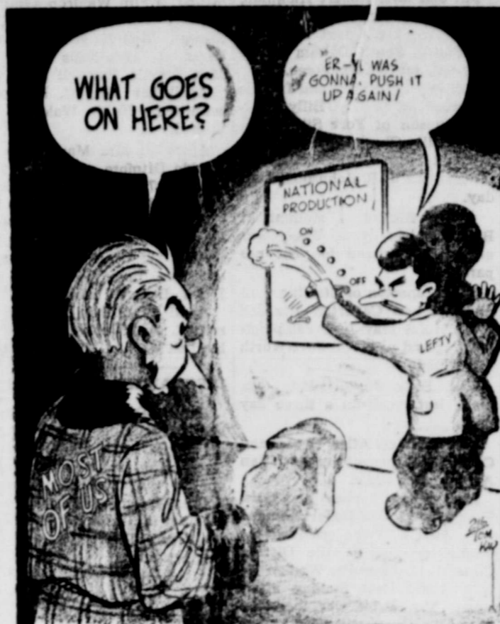
Caught In The Act