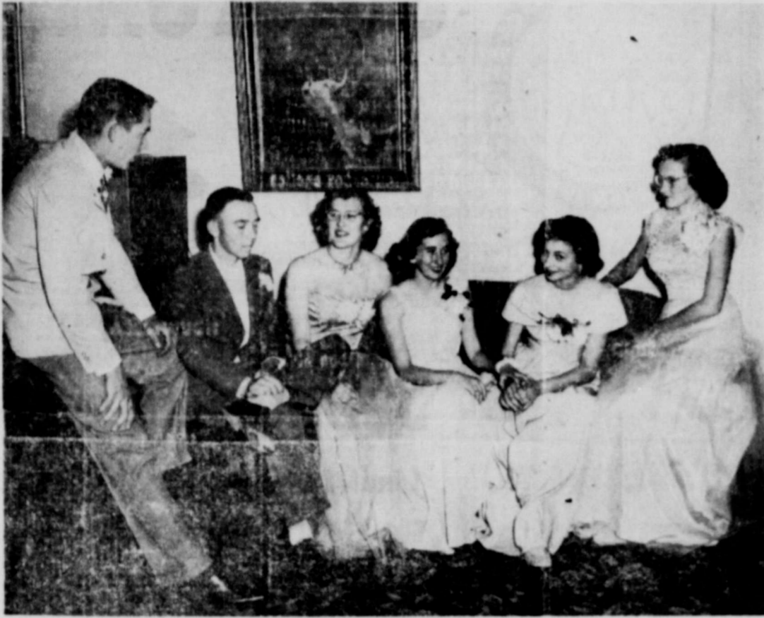
The Junior and Senior Class officers getting together for a chat before the annual Junior Senior Banquet held this year at the Cactus Hotel in San