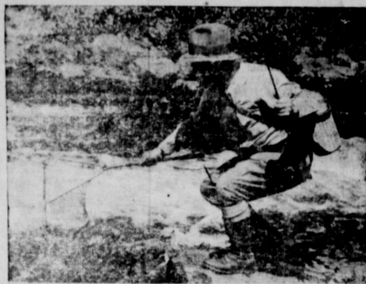
NETTING A CATCH . . . Fishing is one of a variety of sports available in the Province of Quebec, Canada.

QUEBEC CITY, P.Q., CANADA.—Fishing meets and old-fashioned barn dances. Swimming enthusiasts will find excellent facilities available this summer at hundreds of lakes and pools throughout the Province. The Laurentian area alone contains 30,000 lakes, many of which are equipped with rafts and diving towers.