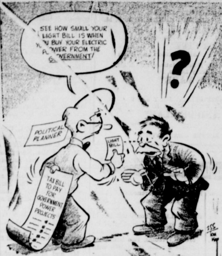
But What About The Second Bill?