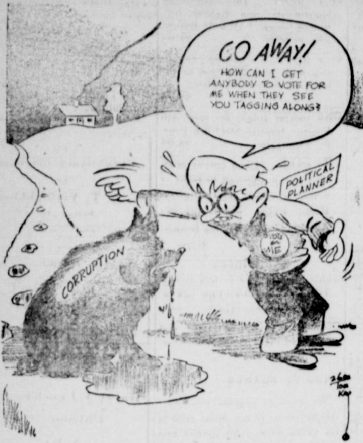
His Frankenstein Monster