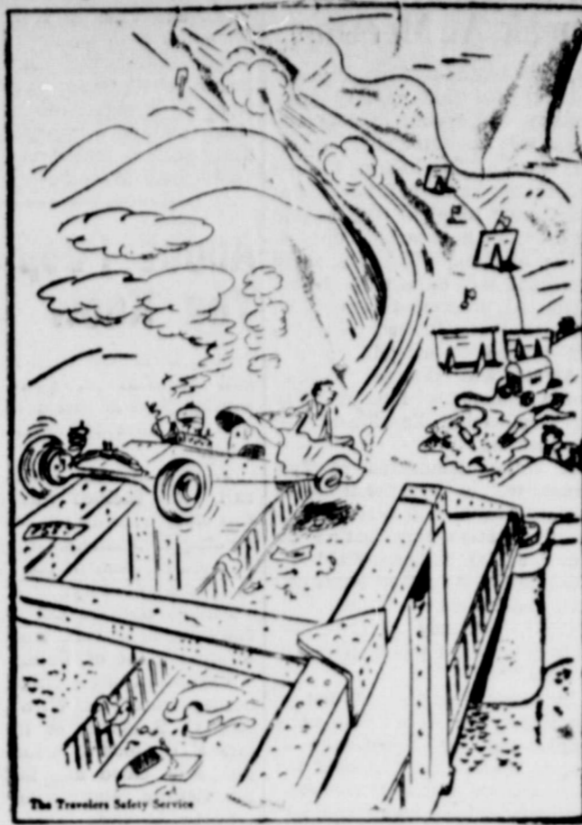
Lucky you—you ignored speed limits and lived