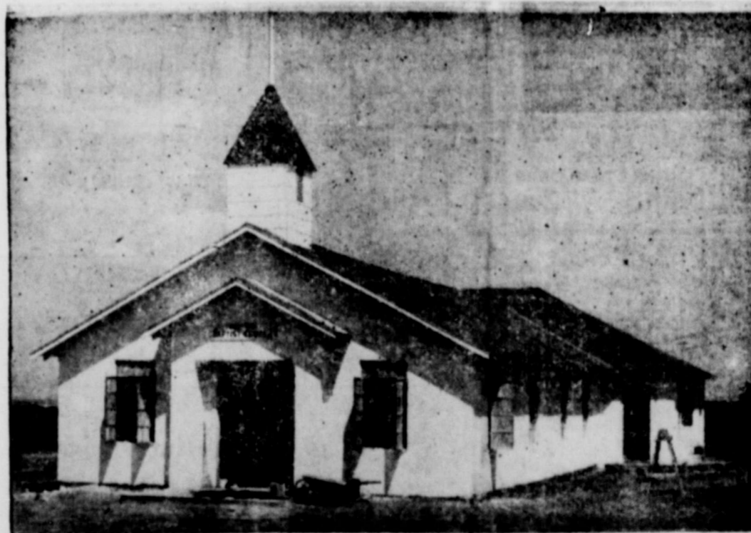
Dedication services were held last Sunday at the new Tennyson Baptist Church. The church has been remodeled and an addition built on. The entire building was given a stucco