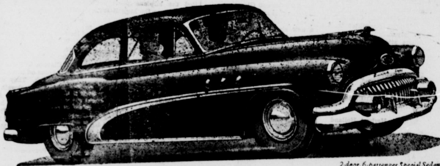
2-door, 6-passenger Special Sedan.

What's the MOST SURPRISING THING about this BUICK?