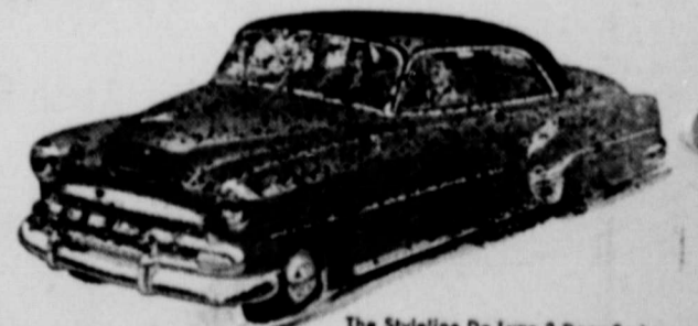
The Styline De Luxe 2-Door Sedan.

(Continuation of standard equipment and trim illustrated is dependent on availability of material.) MORE PEOPLE BUY CHEVROLETS THAN ANY OTHER CAR!