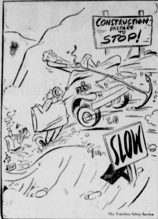
Lucky you—you cheated the undertaker with your broken down car