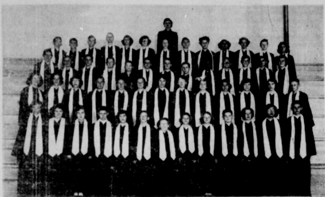
Pictured above is the Junior high school chorus that will appear in next week's musical program at the school.