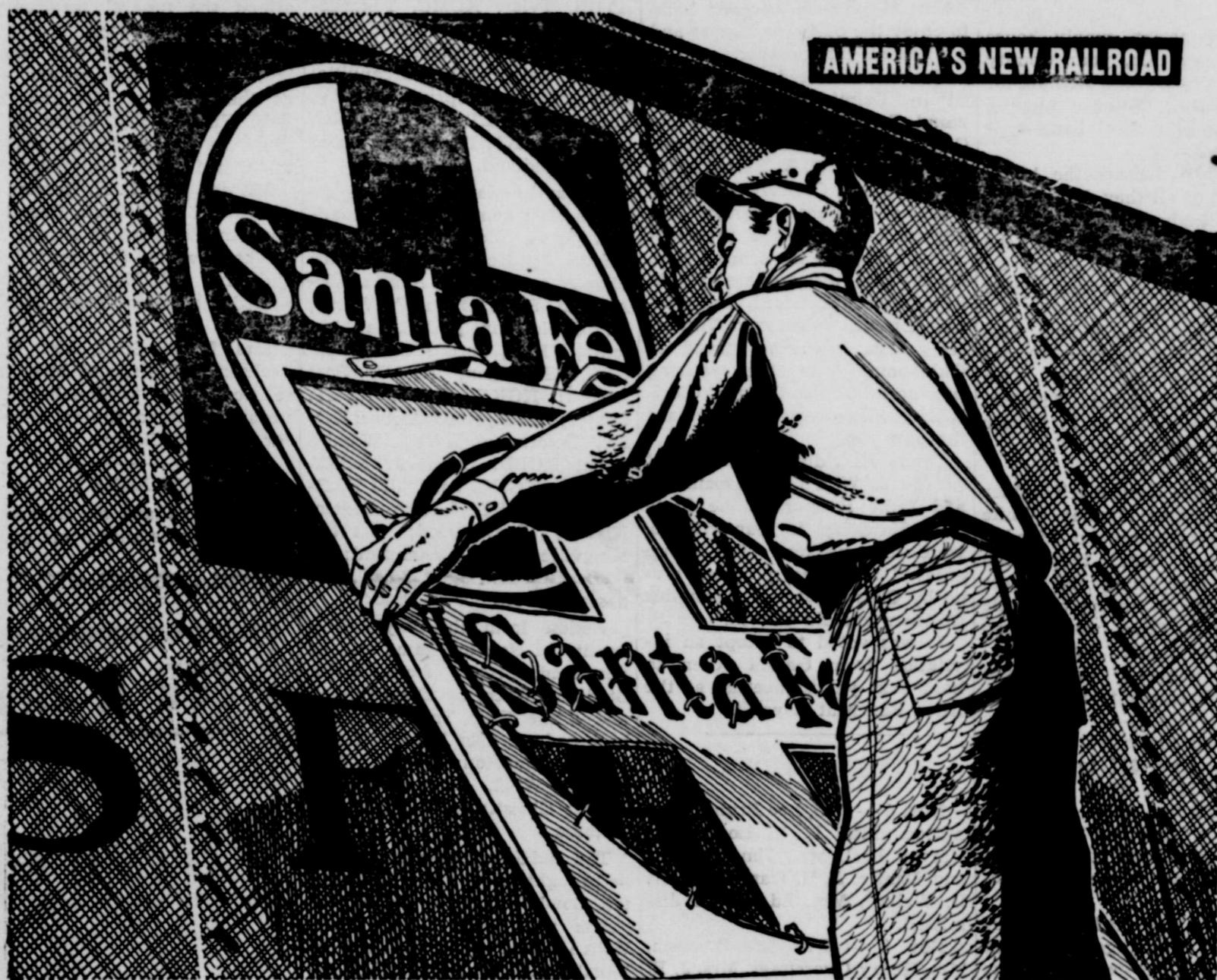
The "stamp of newness"—and another new Santa Fe freight car is ready to roll