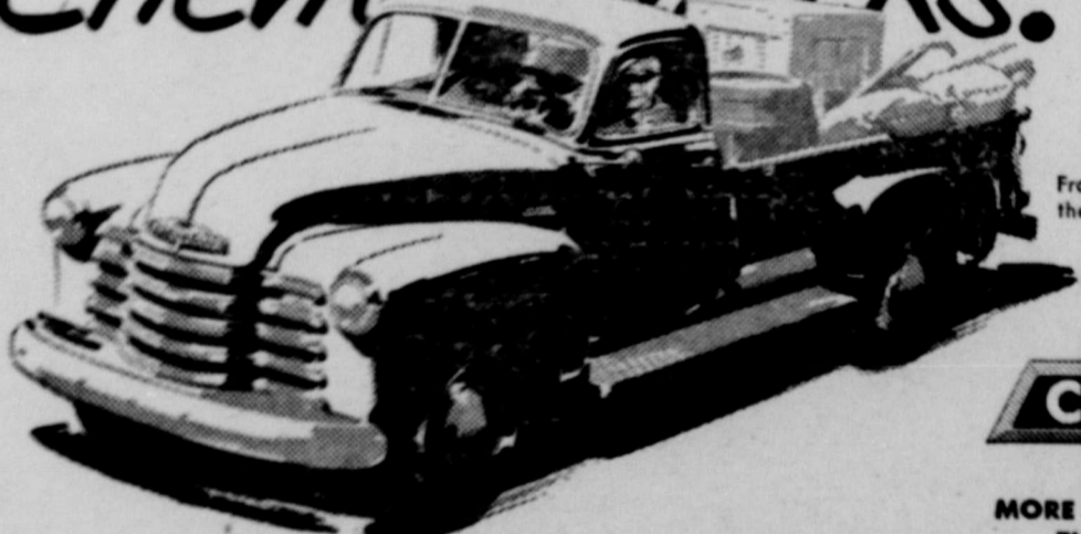
From light delivery to heavy hauling, there's a Chevrolet truck to fit your needs.