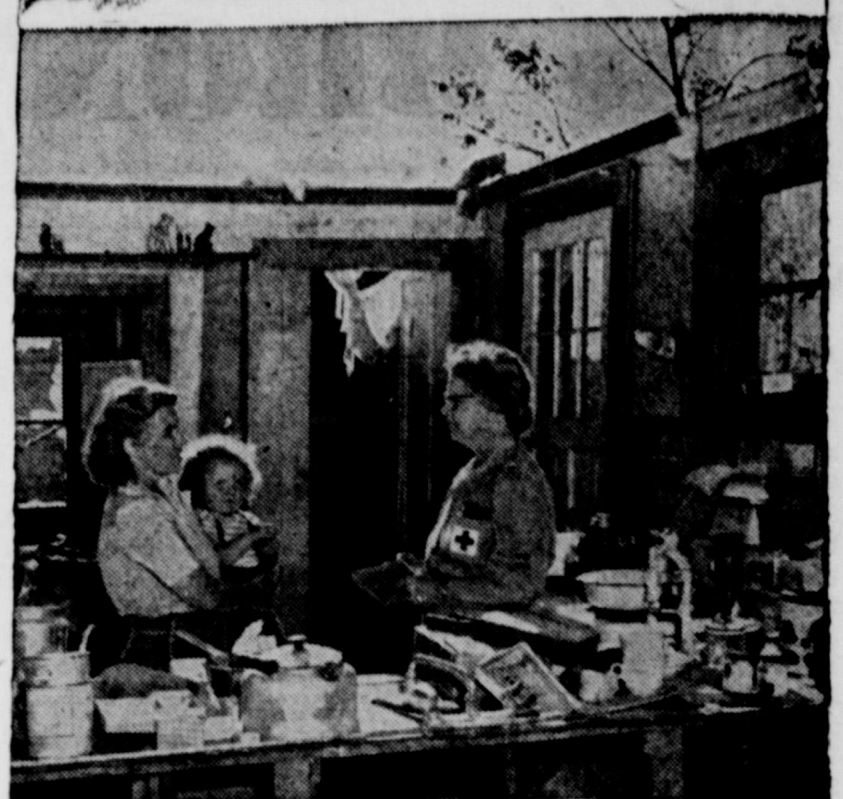
After a tornado has left human suffering and physical wreckage in its wake, the long and less publicized job of restoring homes remains. A Red Cross worker here studies this family's needs—one of over 25,000 assisted last year.