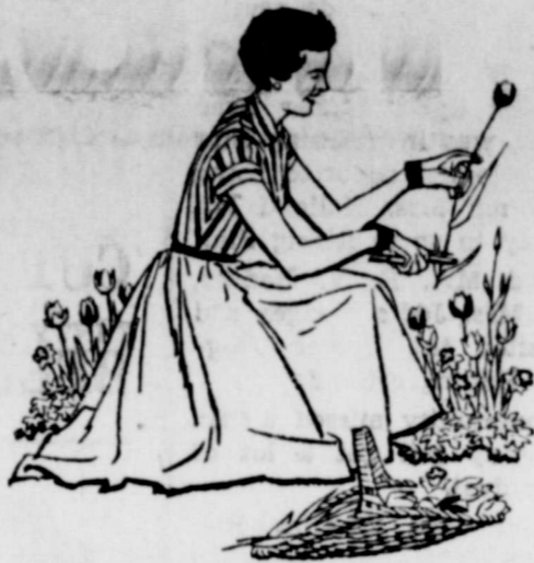
She's doing the laundry—her automatic electric washer and dryer have taken charge.

* DO TWO THINGS AT ONCE WHEN YOU LIVE ELECTRICALLY!