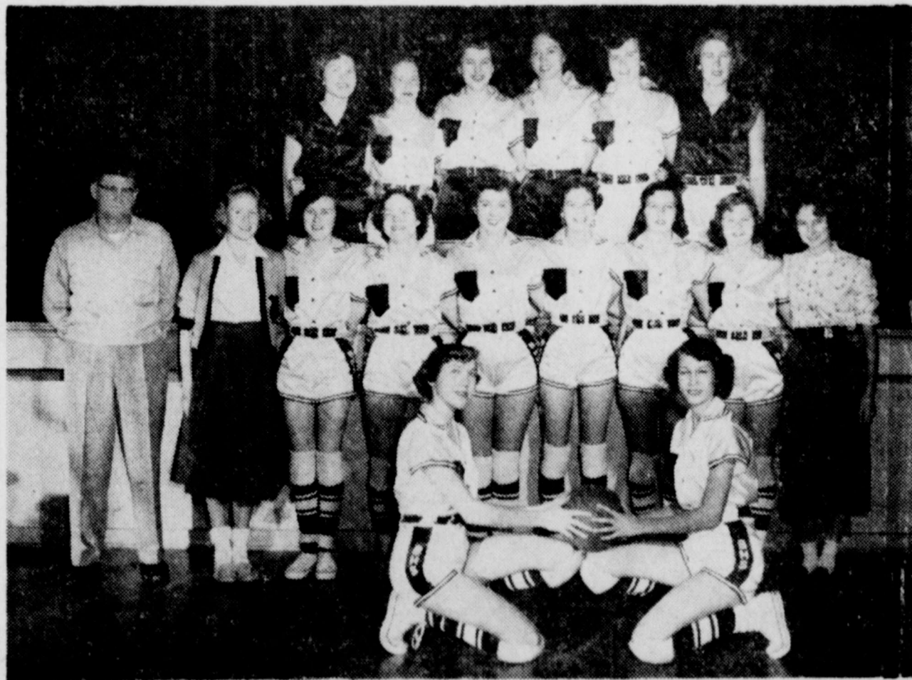
DISTRICT CHAMPS — Bronte's girls basketball team that won the Dist. 20-B championship by taking the first two of a two-of-three series from Mertzon last week.