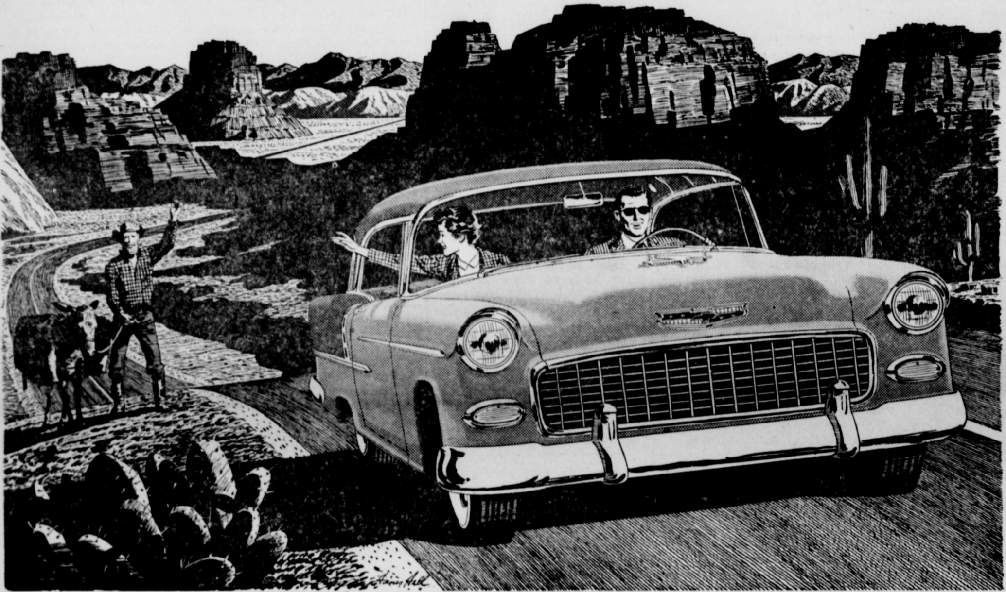
The beautiful Bel Air Sport Coupe with Body by Fisher