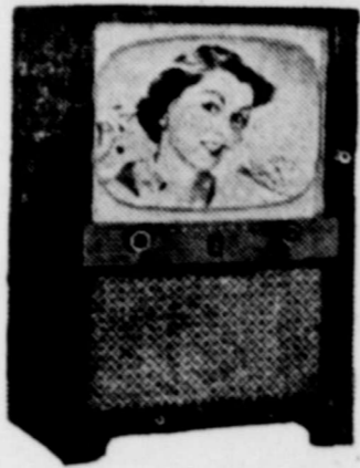
The Stratford $309.95

The beautiful Zenith Stratford, shown here, has a giant 21-inch screen. The big Cinebeam Picture Tube reflects all the light out through the face of the tube, giving whiter whites and blacker blacks—Another feature of the Zenith is top tuning—no stooping or bending to reach tuning knobs. You can own a new Zenith for as little as $10 down and 24 months to pay the balance. Prices are from $159.95 up.