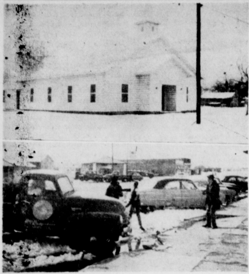
REMEMBER LAST WEEK?—Bronte received about three inches of snow. Top picture shows the Kickapoo Baptist Church covered with the white blanket. The lower photo, as you have probably guessed, was made after school was dismissed Wednesday afternoon. Three local lads are engaged in a snowball fight with some "enemies" across the street.