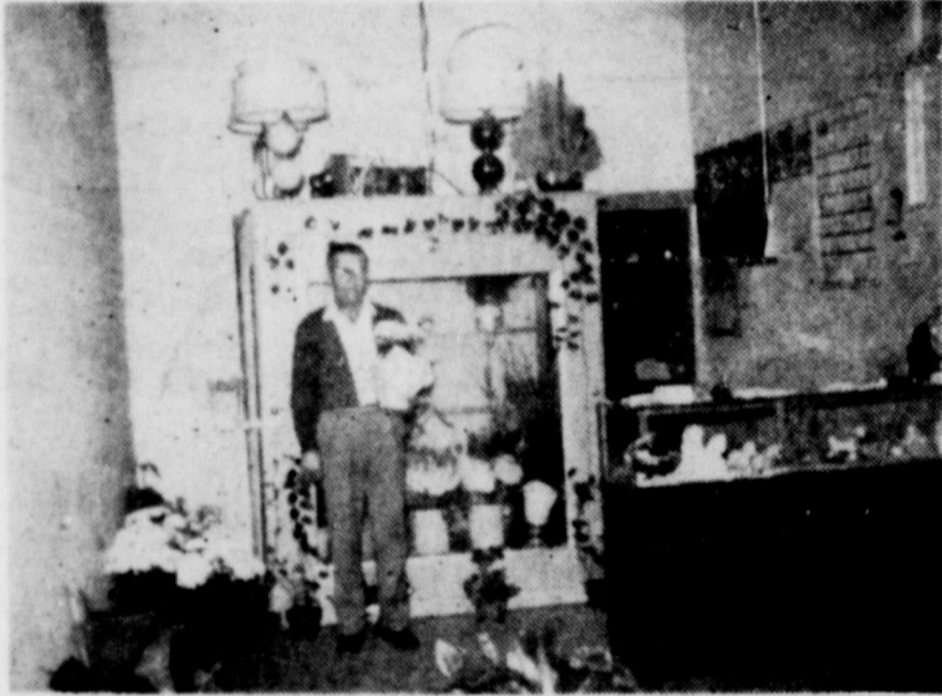
This View Shows Part of Our Increased Space and Merchandise

In order to serve you better, we have just about doubled our floor space. This will enable us to carry a larger stock and display it more effectively. We know we will be able to give you better service and we feel you will enjoy space when you are shopping for flowers.