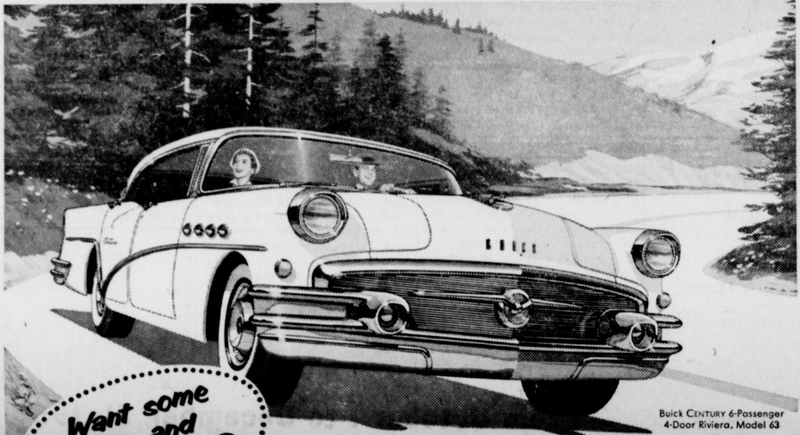
Buick CENTURY 6-Passenger 4-Door Riviera, Model 63