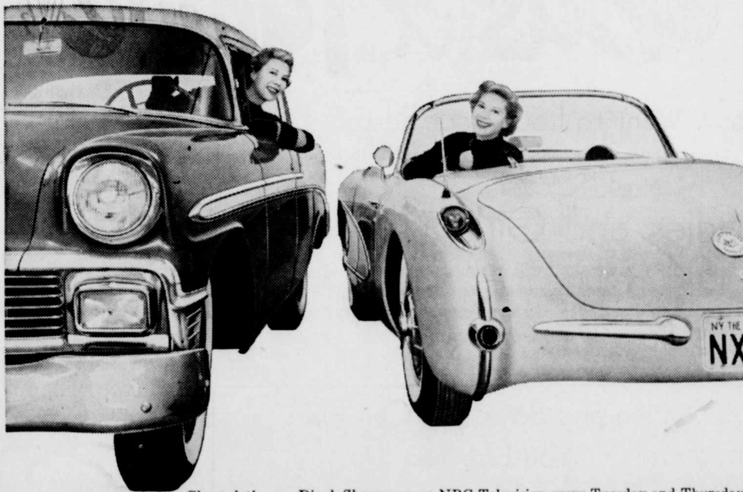
Chevrolet's own Dinah Shore seen on NBC Television every Tuesday and Thursday

Own TWO new Chevrolets for the price of NONE!