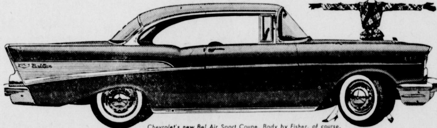
Chevrolet's new Bel Air Sport Coupe. Body by Fisher, of course.

Chevy's lower and longer...and every inch a beauty!