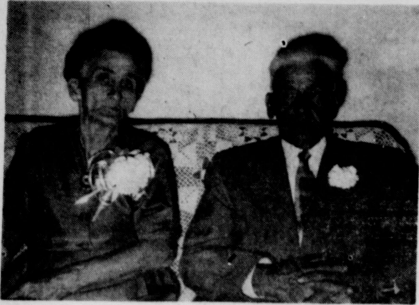
... At Their Golden Wedding, 1956