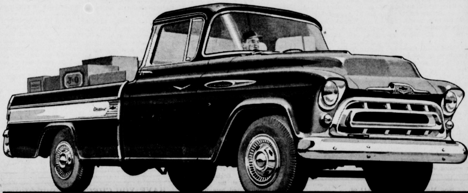
Brawny beauty that knows how to work—the high-styled Cameo Carrier!

Hard-working pickups that know how to save ... both Chevies