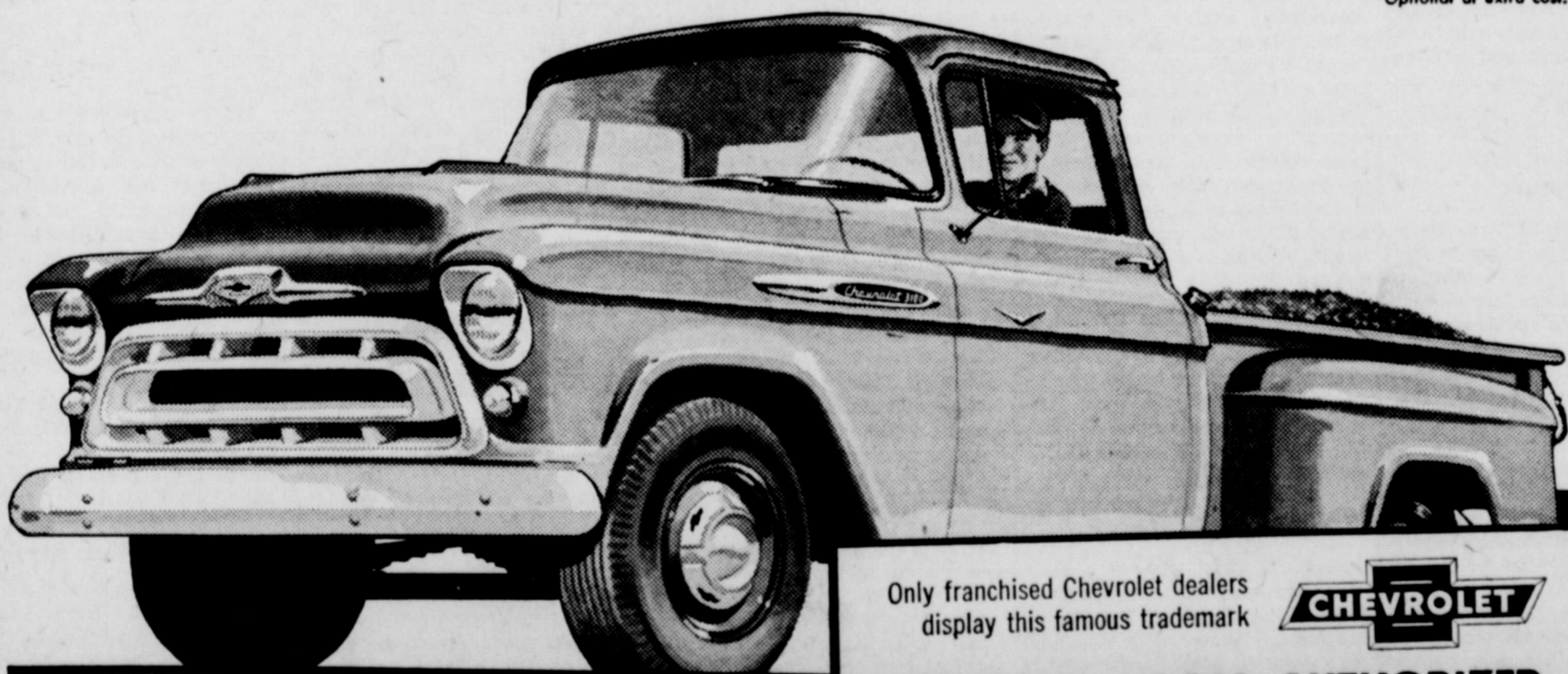
Here's the most popular pickup in America!

Only franchised Chevrolet dealers display this famous trademark