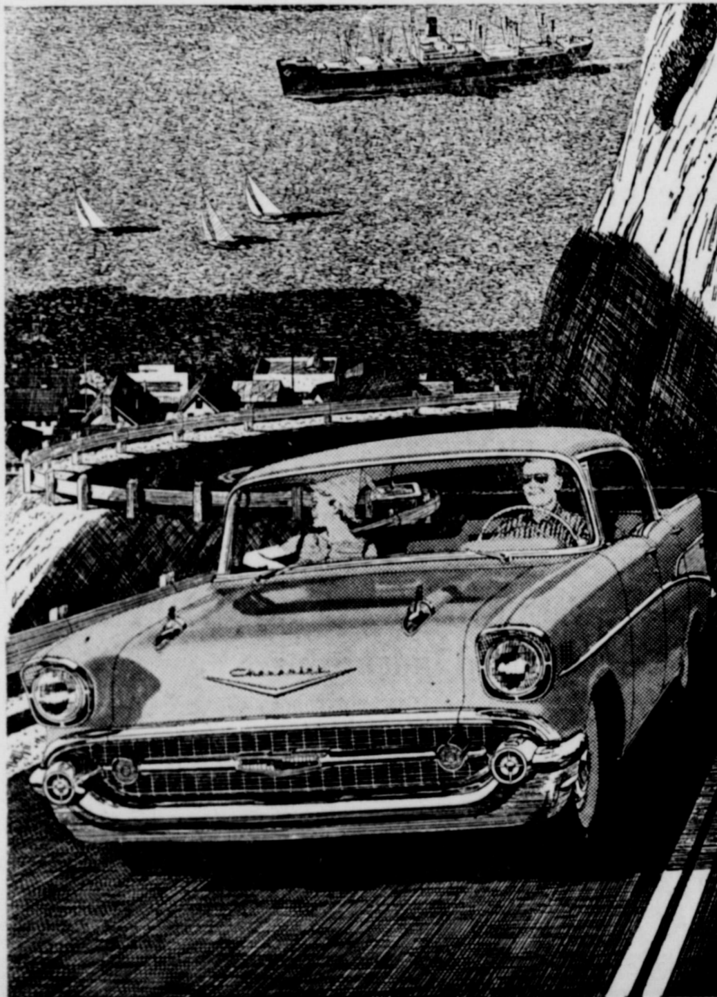
Beautifully built and shows it—the new Chevrolet Bel Air Sport Sedan with Body by Fisher.

You'll find that Chevy's the only low-priced car with any of them . . . the only car at any price with all of them!