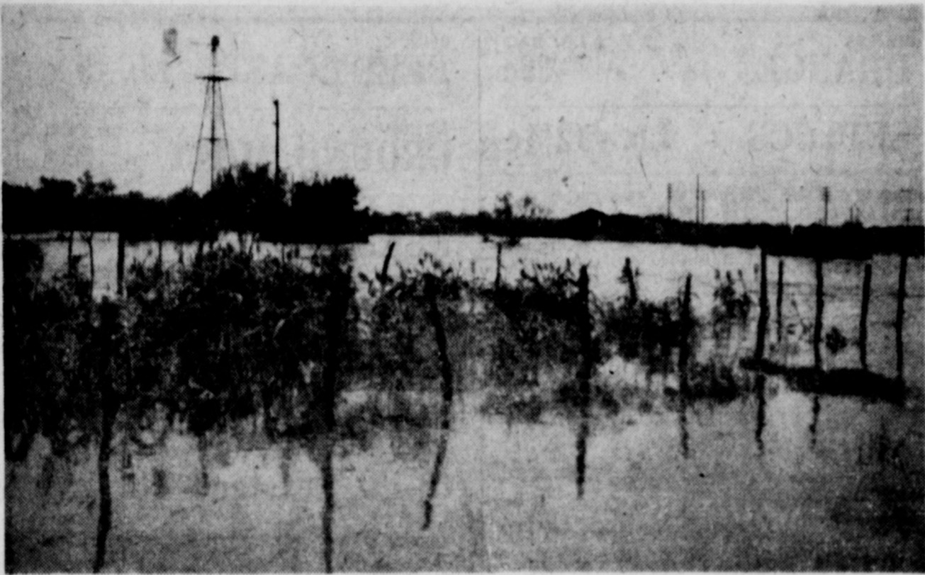
ANOTHER FLOOD SHOT — Flood water in Bronte was photographed from the other side of the creek in the above picture. George Eubanks made this picture from near his home on the north side of the East Kickapoo. Maybe you can see the highway bridge in the background.