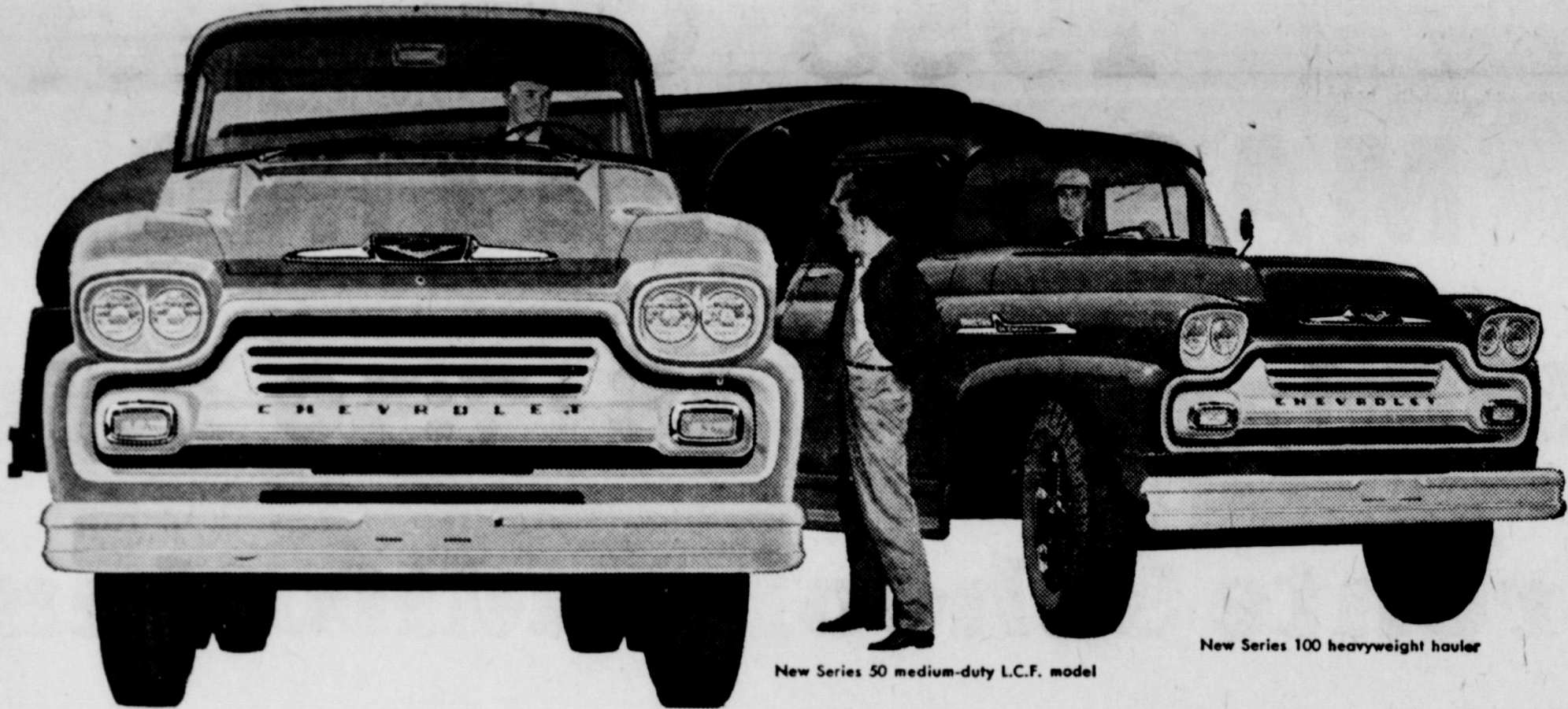
New Series 50 medium-duty L.C.F. model